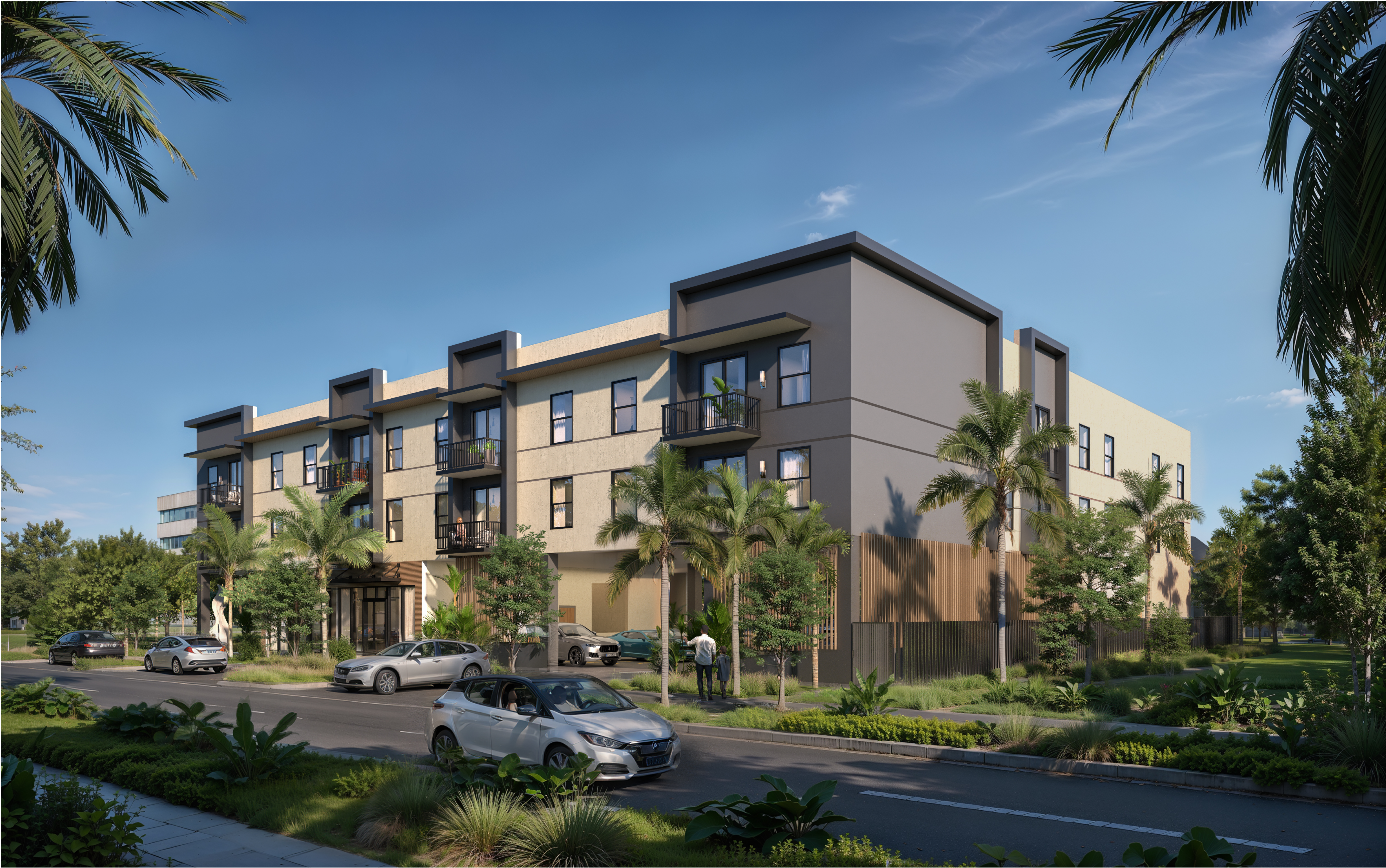
3D RENDERING - NORTHWEST CORNER VIEW (FRONTAGE ELEVATION NW 6TH STREET)